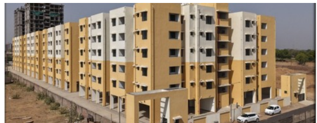
Delivered residential & mass-housing projects — multi-tower complexes for GUDA, GNMC and Gujarat Police Housing.